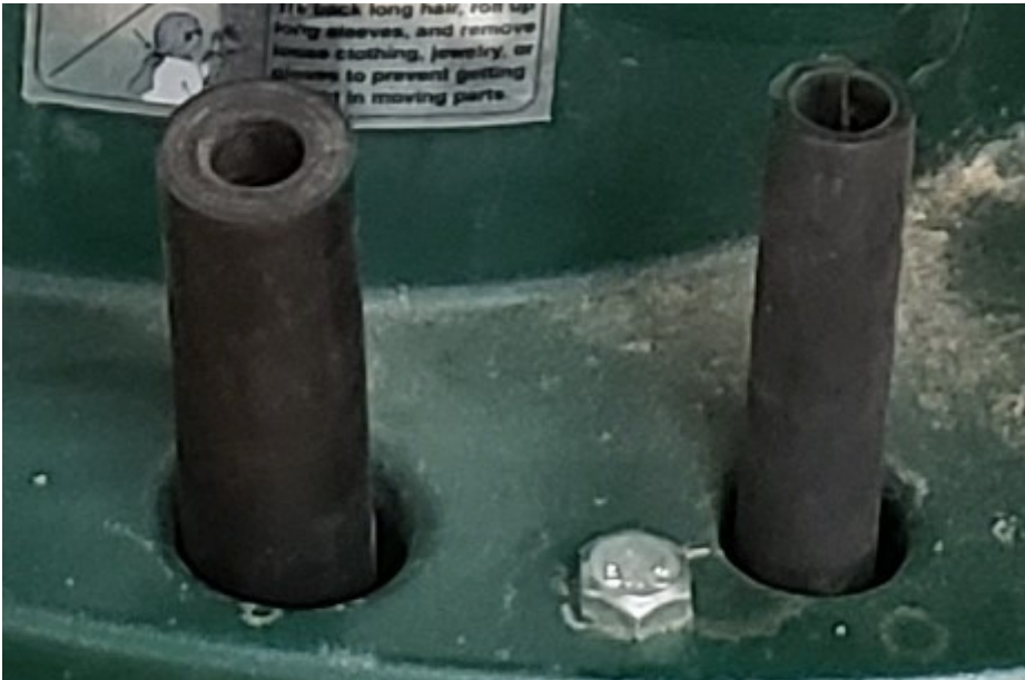
Abrasive Sleeves - These consumables slip over the drums.