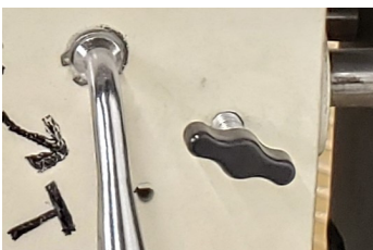
Belt Tension Locks - Locks the belt tension in place