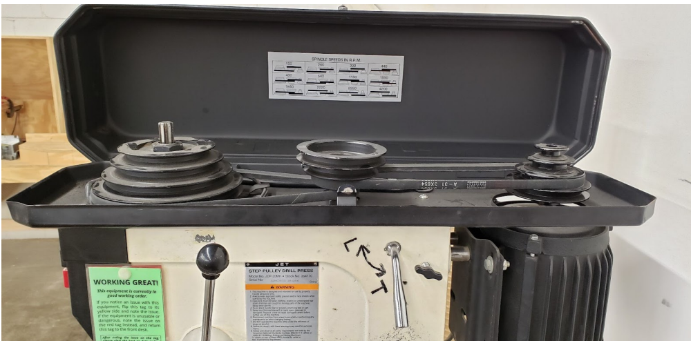
Belt Tension Lever - Adds or removes tension from the drive belts